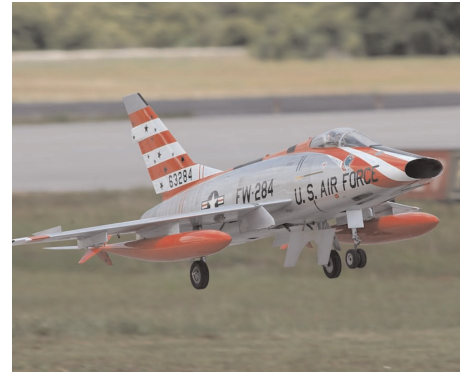
An impressive BVM F-100D flown by Gerardo Diaz in Pro Am/Pro. Powered by a JetCat Titan turbine.