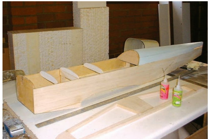
Rear foam turtle deck and front balsa deck formers are shown glued in place.

and glue them to one side using Z-epoxy for the firewall, and CA for the other formers. Use a square to make sure everything is aligned properly. A 1/4-inch balsa "tripler" fits in between the formers at either side of the wing to provide strength to the wing saddle.