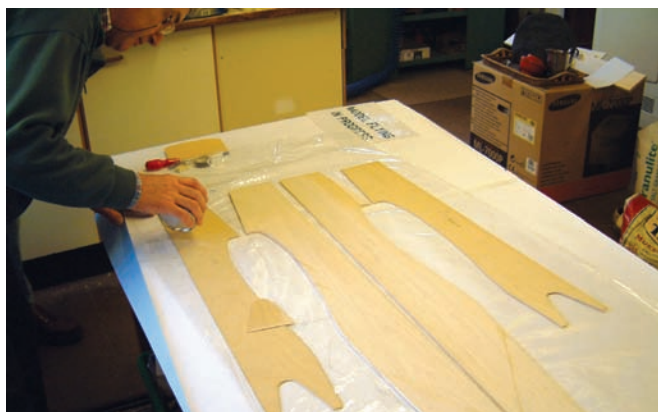
Fuselage sides and ply doublers being glued together with contact adhesive.

4-inch-wide balsa sheets. Make up two thin plywood doublers and attach them to the sides with contact adhesive making a left- and a right-hand side. The doublers are set back \frac{3}{8} -inch from the front of the balsa sides. This allows the firewall to fit flush into place. Cut all the formers and firewall from the materials shown on the plans