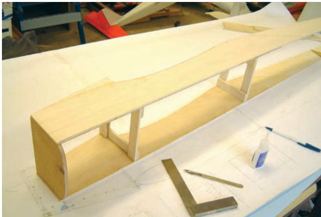
The second side is added to the fuselage structure. Keep everything square and aligned.